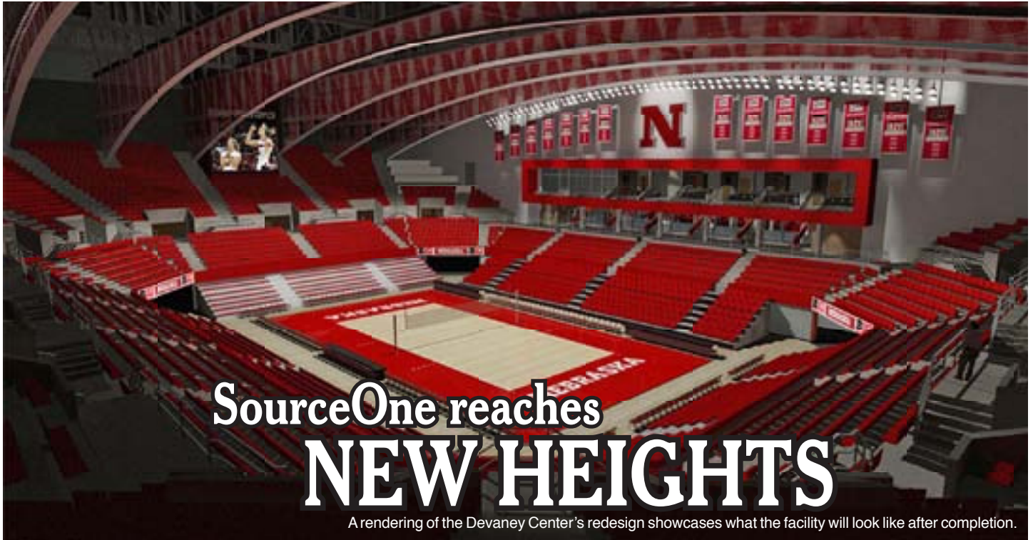
A rendering of the Devaney Center's redesign showcases what the facility will look like after completion.