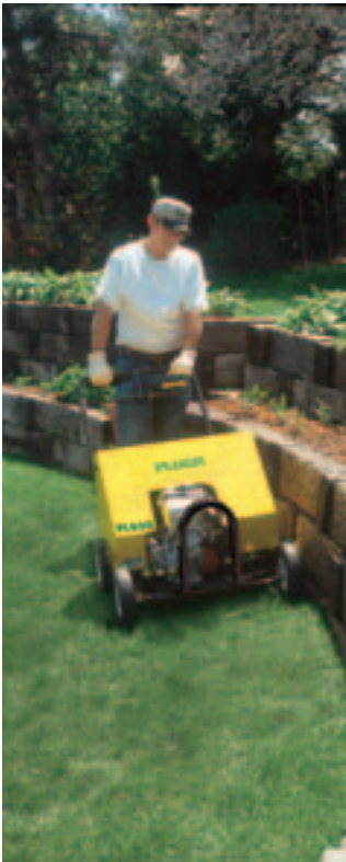
PLUGR's former PL800 Pro 30" Aerator featured a tubular structure.

When PLUGR needed help streamlining its walk-behind aerator product line, it trusted SourceOne to tackle the challenge.