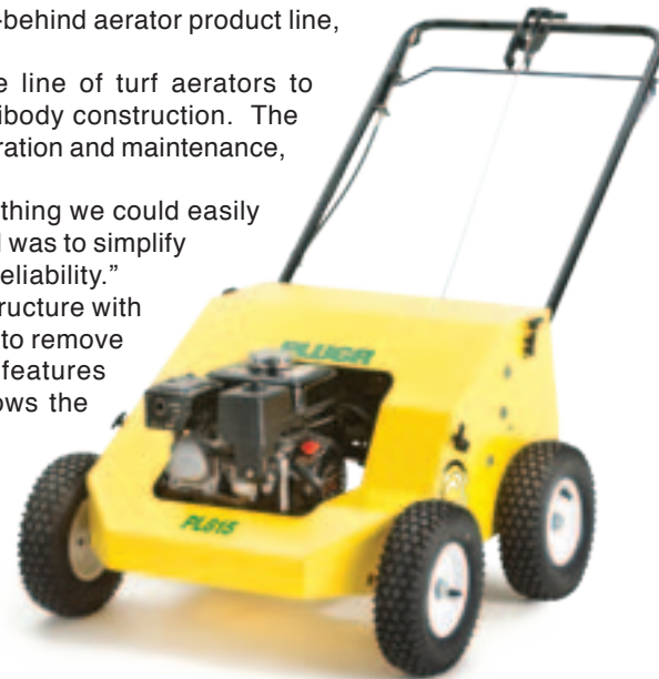
PLUGR's redesigned line of walk-behind aerators features a sleek and compact design that increases user functionality and is more cost-effective to manufacture.

"SourceOne was detail-oriented throughout the entire design process," he said. "They kept our customer in mind the entire time, which is a quality we really value."